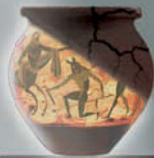
CLAY POT before and after Showing the difference between how the pot was found and its original painted decoration