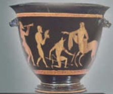
DECORATIVE POT This decorative pot has been restored using projected light to show its original condition